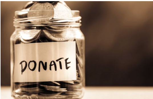
Tzedakah & Philanthropy