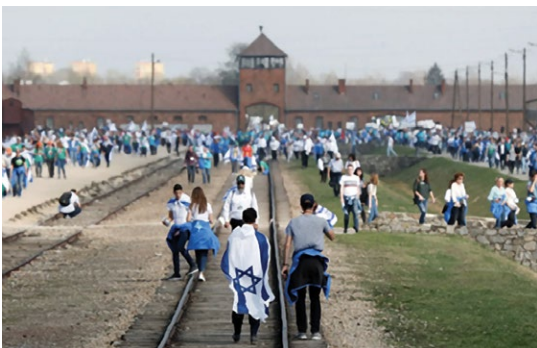
Honoring Our Jewish Past